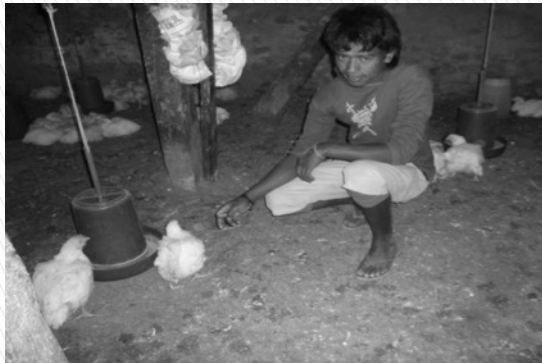
Poultry farming after time saving