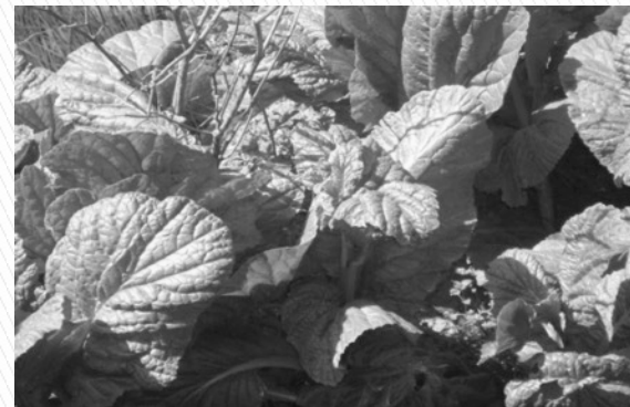
Grey water irrigated vegetables in kitchen garden