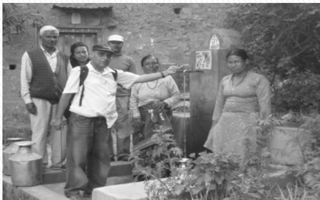
Meeting with MotherTap stand groups