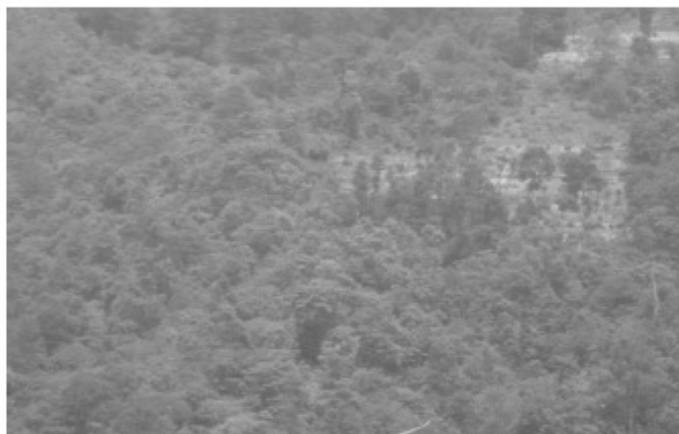
Catchment area of Purnimakanlo source