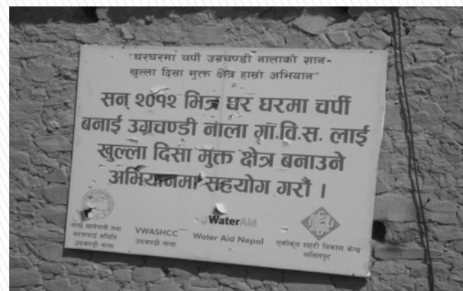
ODF Zone Ugrachandinala VDC