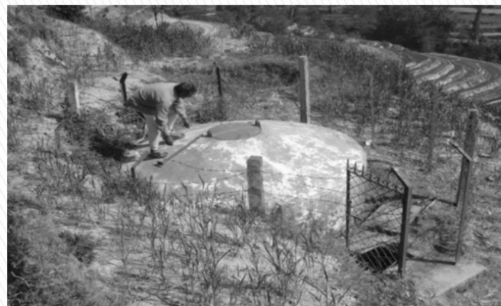
Protected Ferro cement RVT (7.0m3)