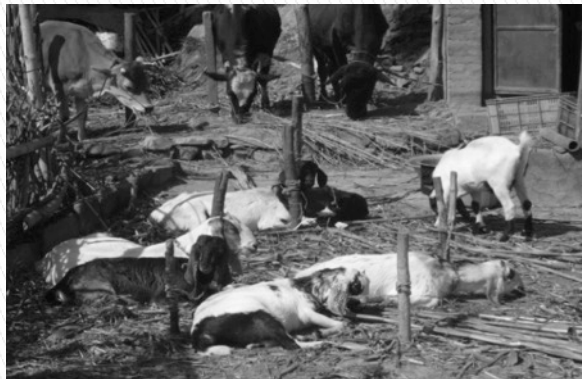
Using saved time in goat rearing