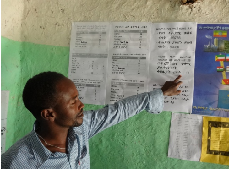
Photo: a typical spring-eye protection; Photo: showing progress on the walls of the Woreda Water, Mines and Energy office