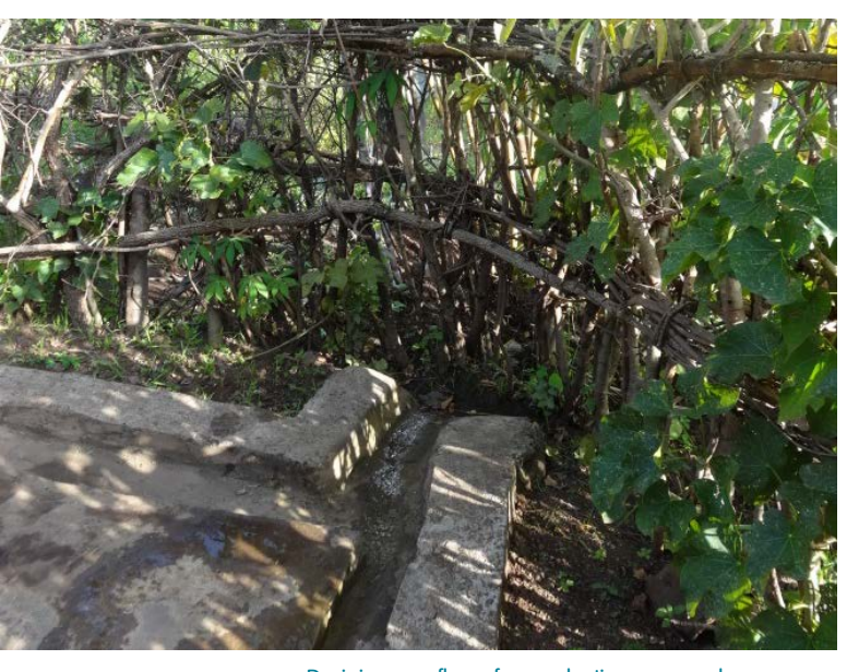
Draining overflows for productive use nearby